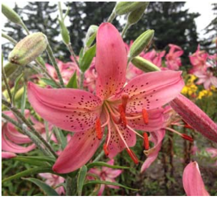
Dori Jo with spots or freckles on the throat.

Flower sizes range from small and delicate to large and robust, and can be found singly on a stem or as multiple blooms (up to 50) arranged in a variety of ways. Flower orientation varies as well, with some lifting their faces to the sky, some facing to the side and others gracefully