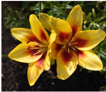
Gran Cru with coloured throat