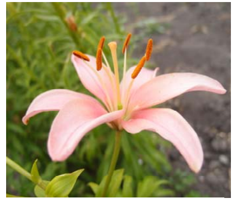
Gypsy with clear pink colour

drooping downwards. Flower shapes can resemble trumpets, bowls, or goblets depending on the degree to which the petals curve out and back from the center of the plant. In the most extreme case, the petals curve back towards the base of the flower, creating a turk's cap shape.