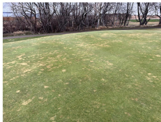
(right) Early Season Pythium , coastal BC