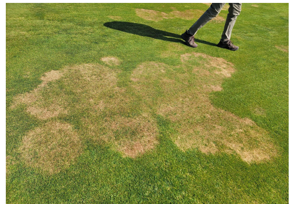
Pink snow mold breakthrough after 168 days under cover of snow (right)

Last fall, Alberta also experienced a shortened fall hardening period, with unseasonably warm fall temperatures throughout October. Daily highs in October were in the mid-high twenties, then temps dropped dramatically to just 6°C; with under a week for the plant to harden and brace for permanent snowfall. Faced with a narrow window to apply final fungicide applications, tarps, etc., we lost our typical 2-3 week fall hardening period, which we feel played a role in overwintering strength.