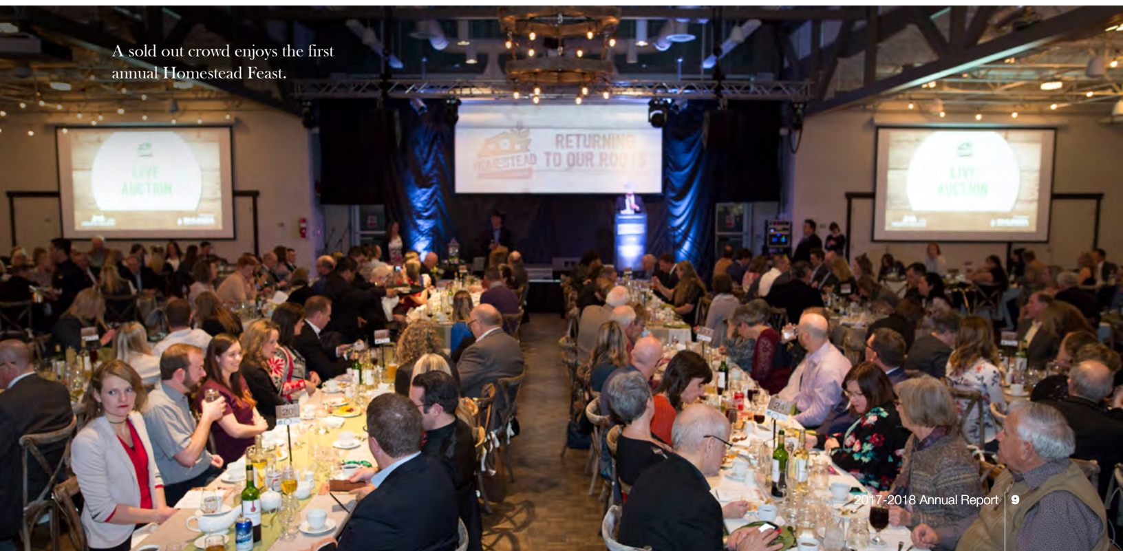
A sold out crowd enjoys the first annual Homestead Feast.

The Wetlands Research Project proposes to study the use of native wetland plants and cold climate floating island systems for the remediation of contaminated water and water with excessive nutrients.